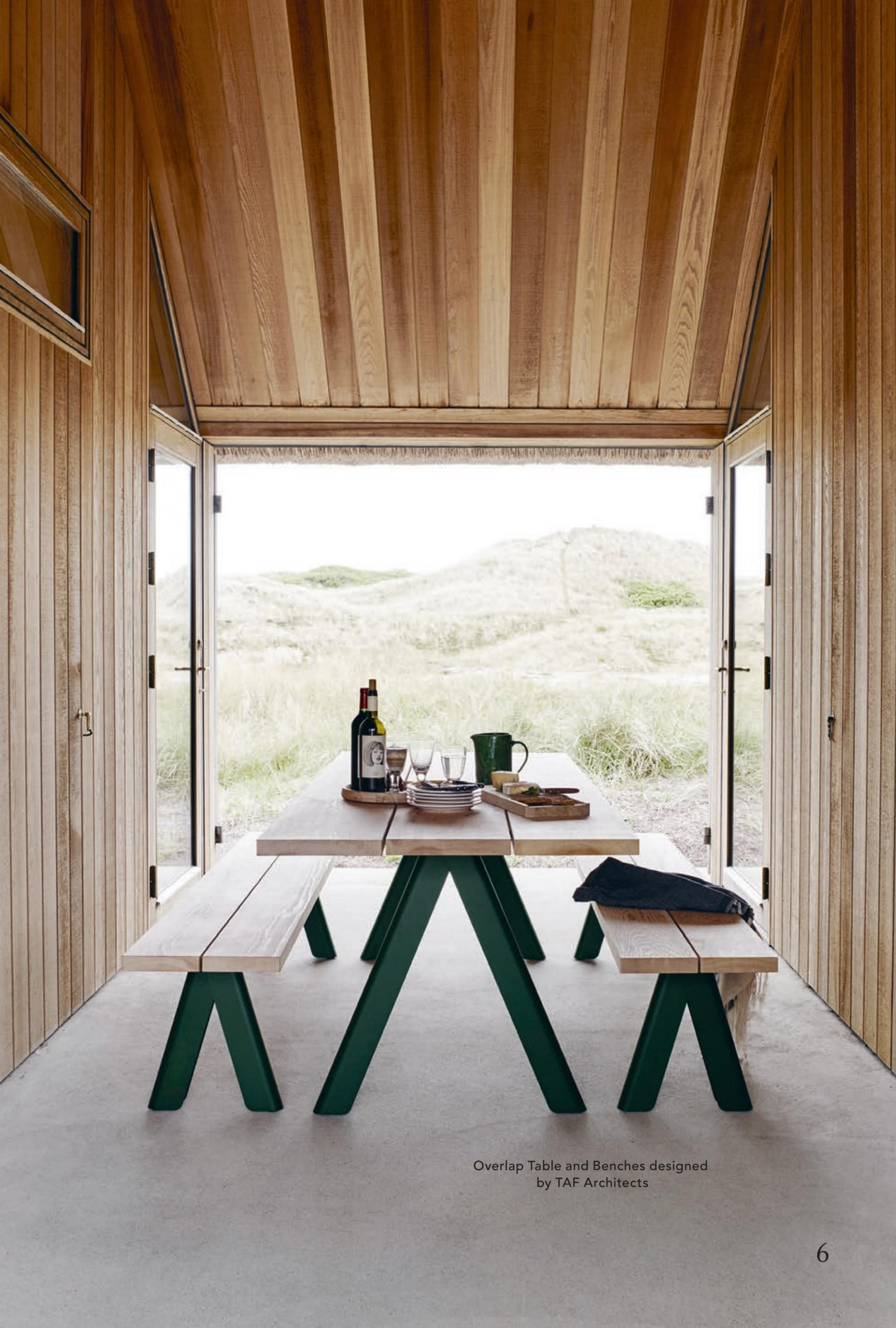
Overlap Table and Benches designed by TAF Architects