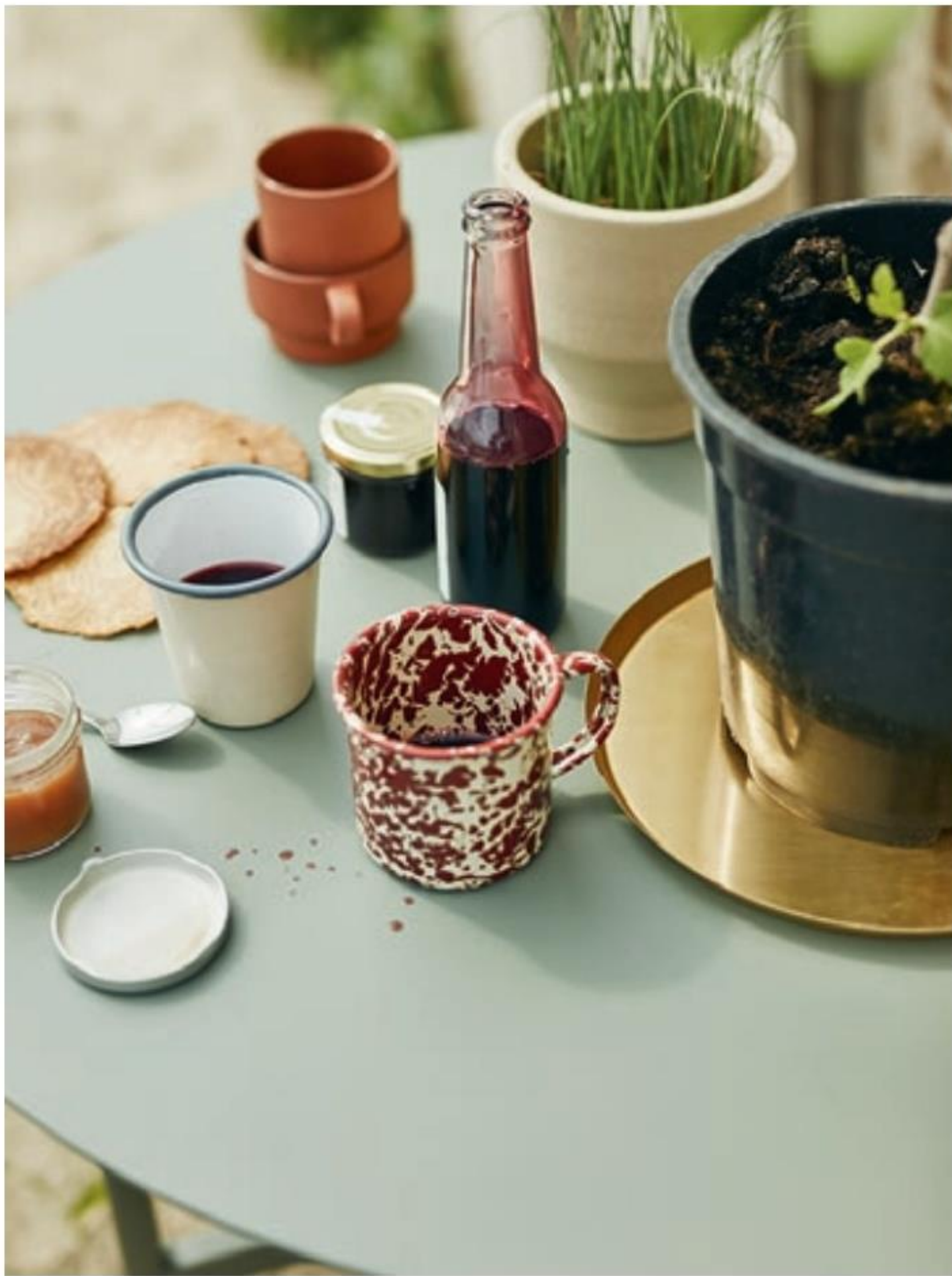
Edge Pots, Brass Plate, Cup and Mug designed by Stilleben