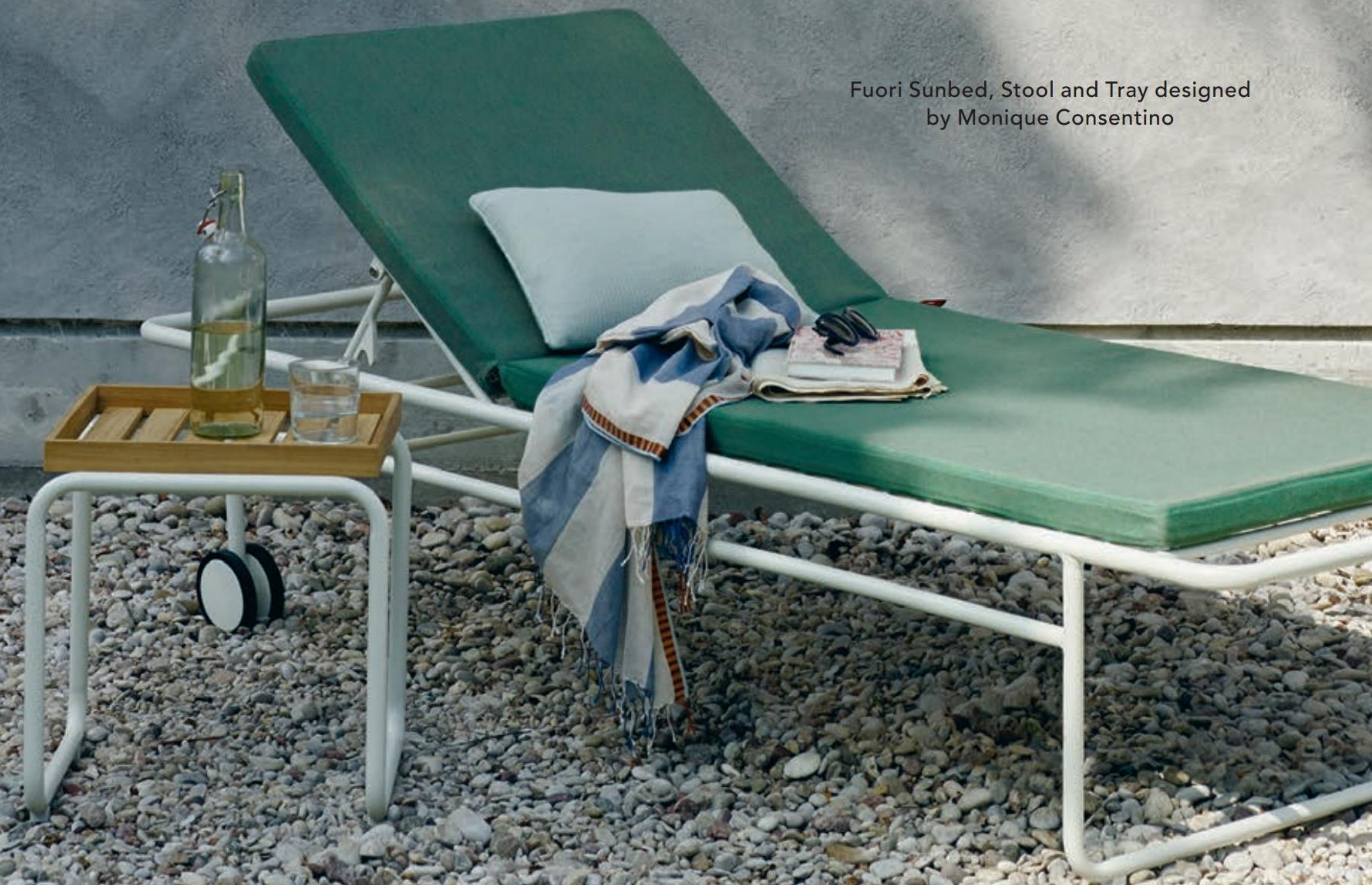
Fuori Sunbed, Stool and Tray designed by Monique Consentino