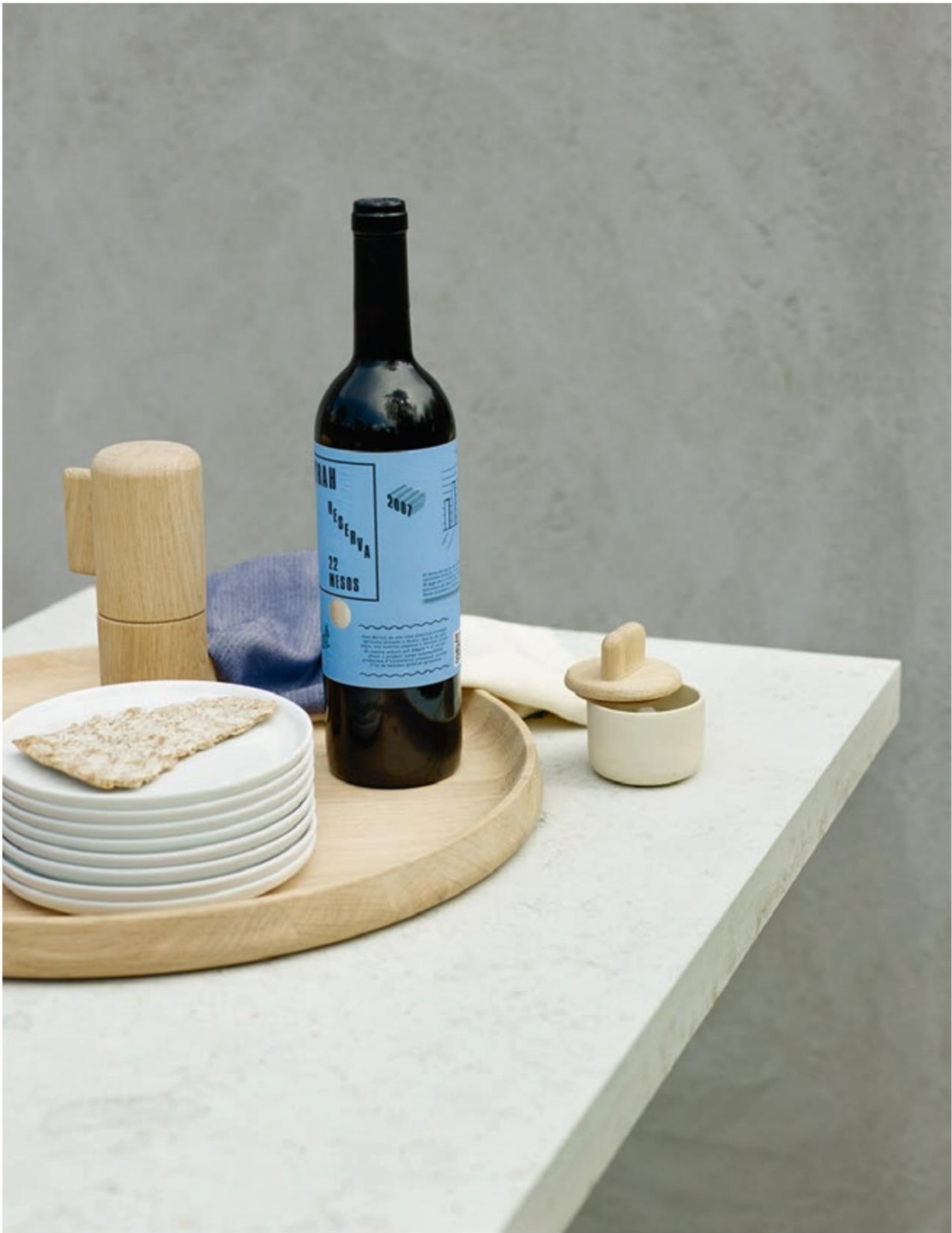
Nordic Tray and Plates by VE2, Paddle Grinder and Jar by NOIDOI and Stripes Tea Towel by All the way to Paris