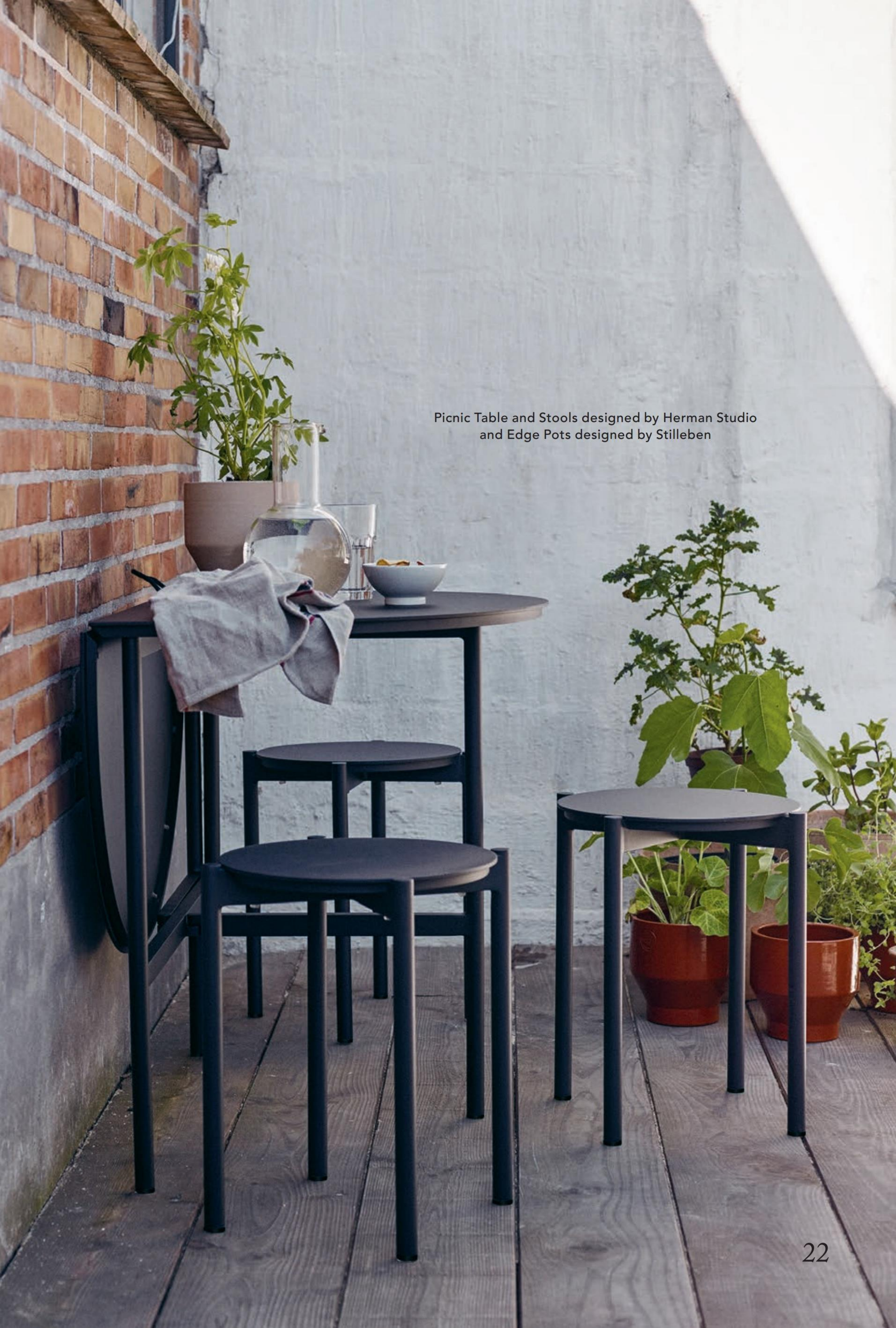
Picnic Table and Stools designed by Herman Studio and Edge Pots designed by Stilleben