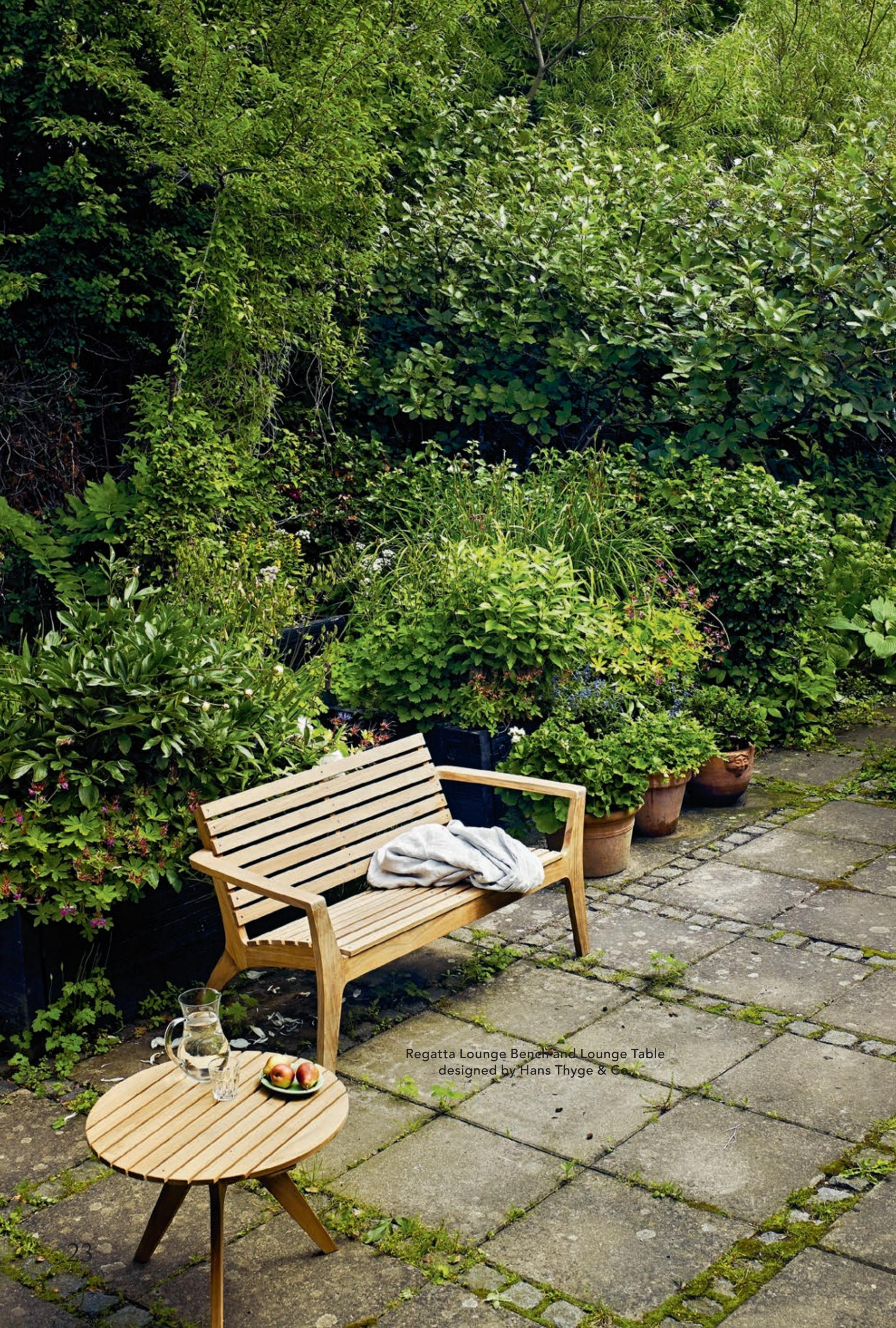
Regatta Lounge Bench and Lounge Table designed by Hans Thyge & Co.