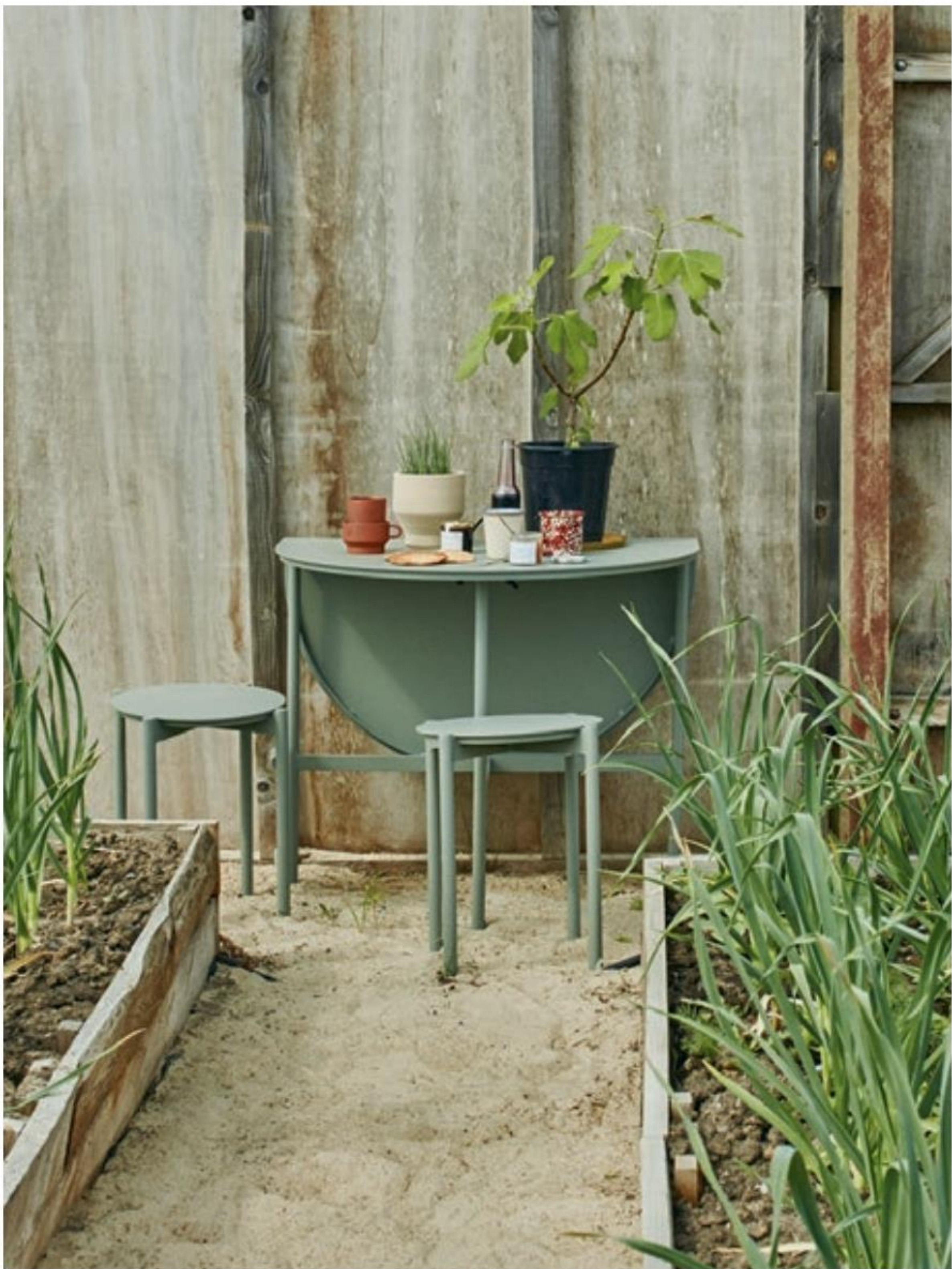
Picnic Table and Stools designed by Herman Studio