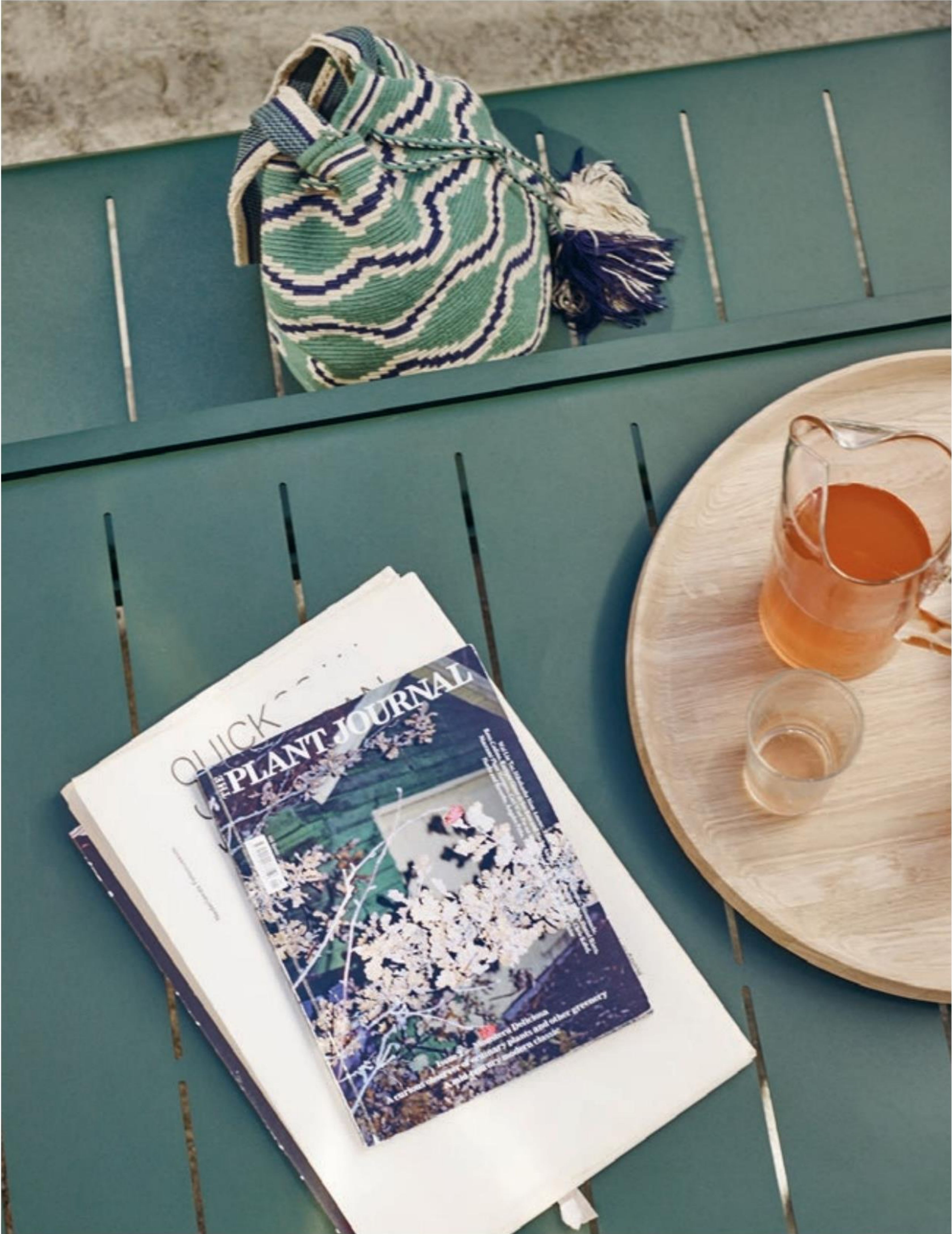
Reform Table and Bench designed by Louise Hederström Nordic Tray Ø45 designed by VE2