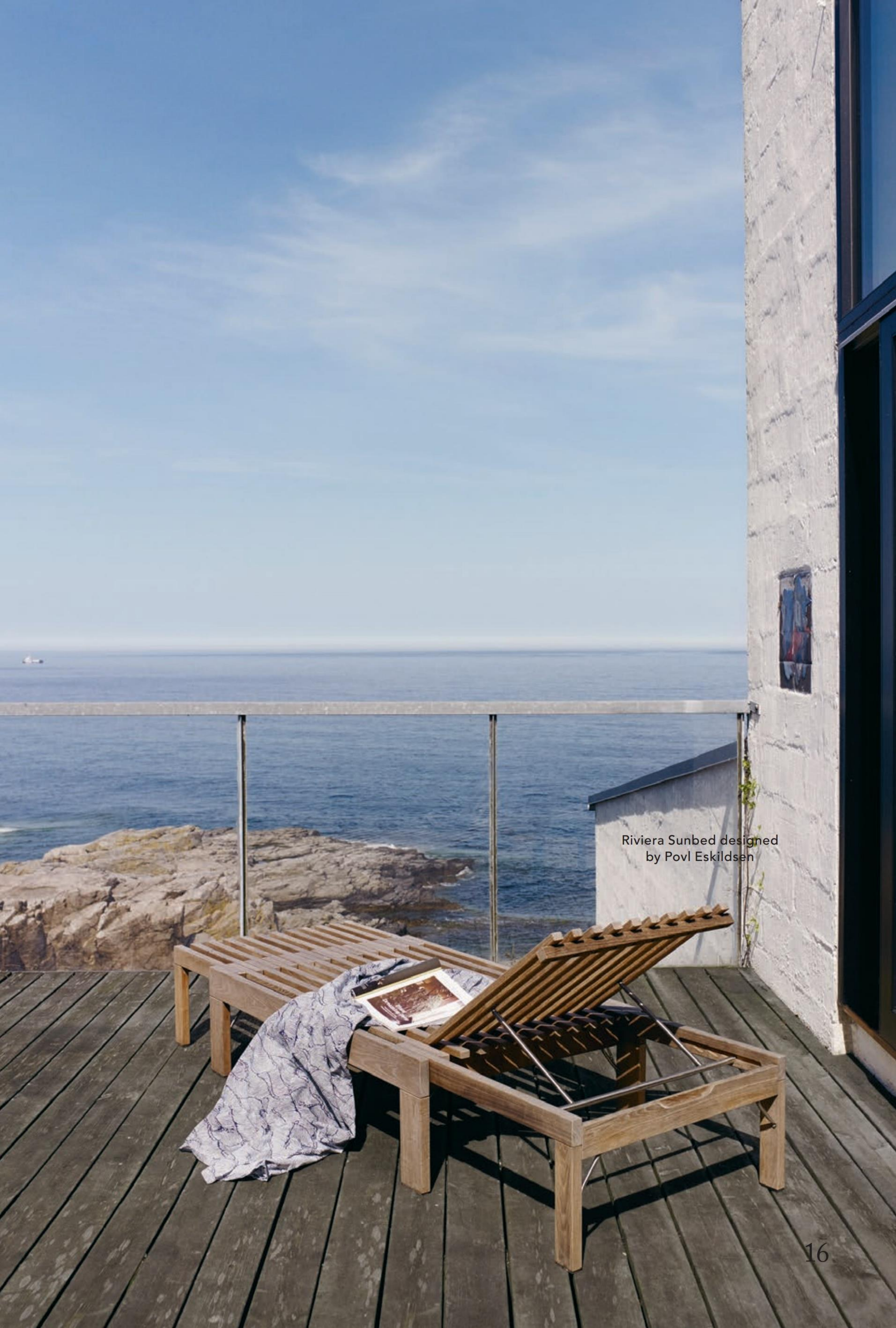
Riviera Sunbed designed by Povl Eskildsen