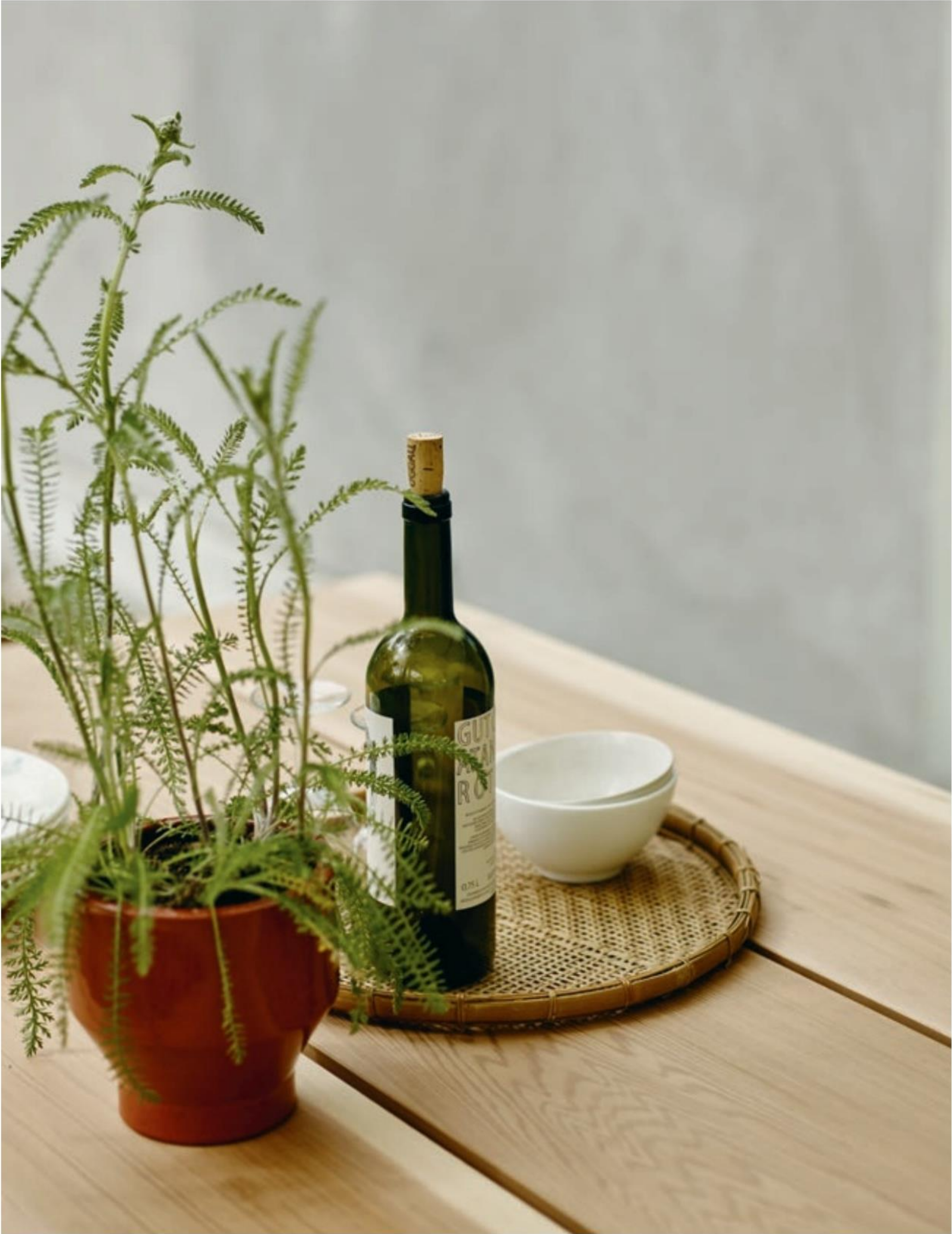
Overlap Table designed by TAF Architects Edge Pot designed by Stilleben