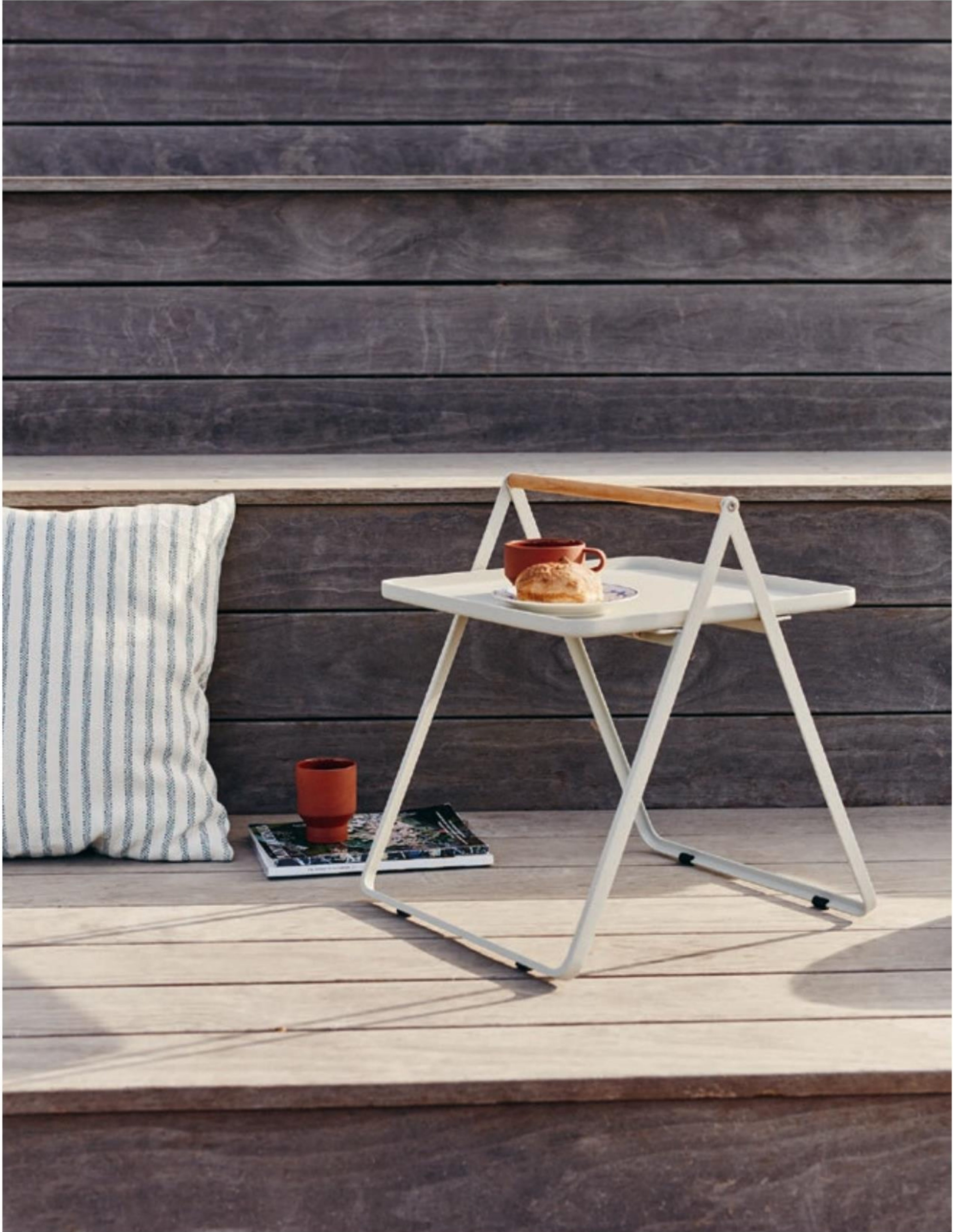
By Your Side Table designed by Maximilian Schmahl and and Edge Cup and Mug designed by Stilleben